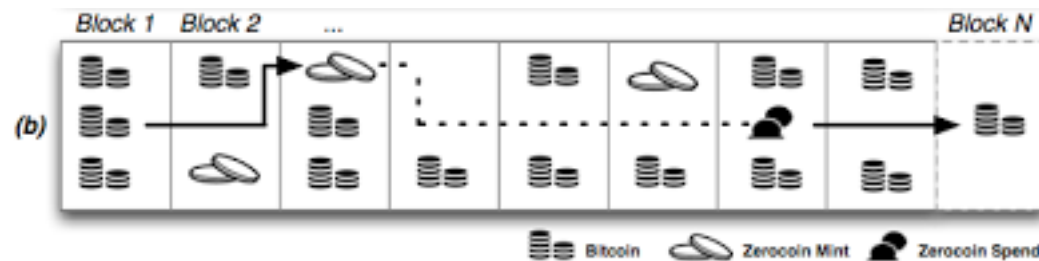
Zerocoin Scheme for Bitcoin:

For more information about the Zerocoin protocol, visit http://zerocoin.org/